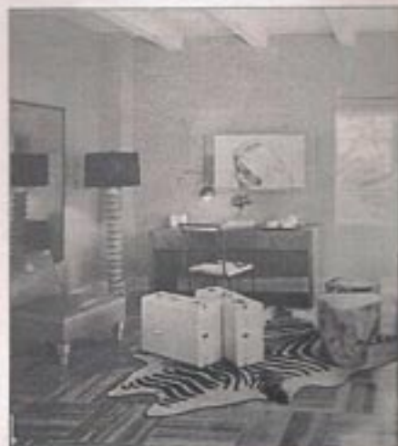
BEST ART DECO HOTEL: The Tides

Miami rooms. gh they co days equip- ad DVD is right Beach Miami site: