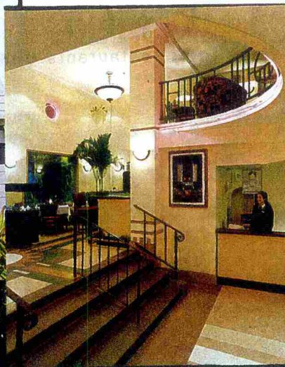
Deco glamour at the Beacon Hotel, FAR LEFT and LEFT.